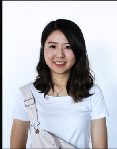
SEASON WONG THE LAST BROADCAST