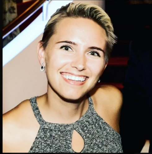
INDIA MARIE DAISY VIOLET THE BITCH BEAST KING