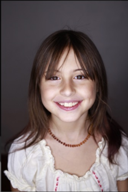
LIVELY POPE PINELLI