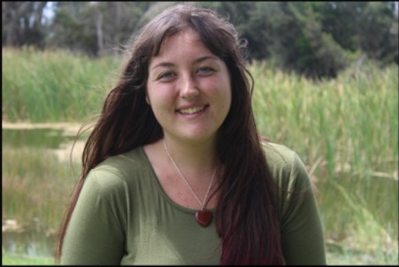
TAYLOR SWEAT DAISY VIOLET THE BITCH BEAST KING